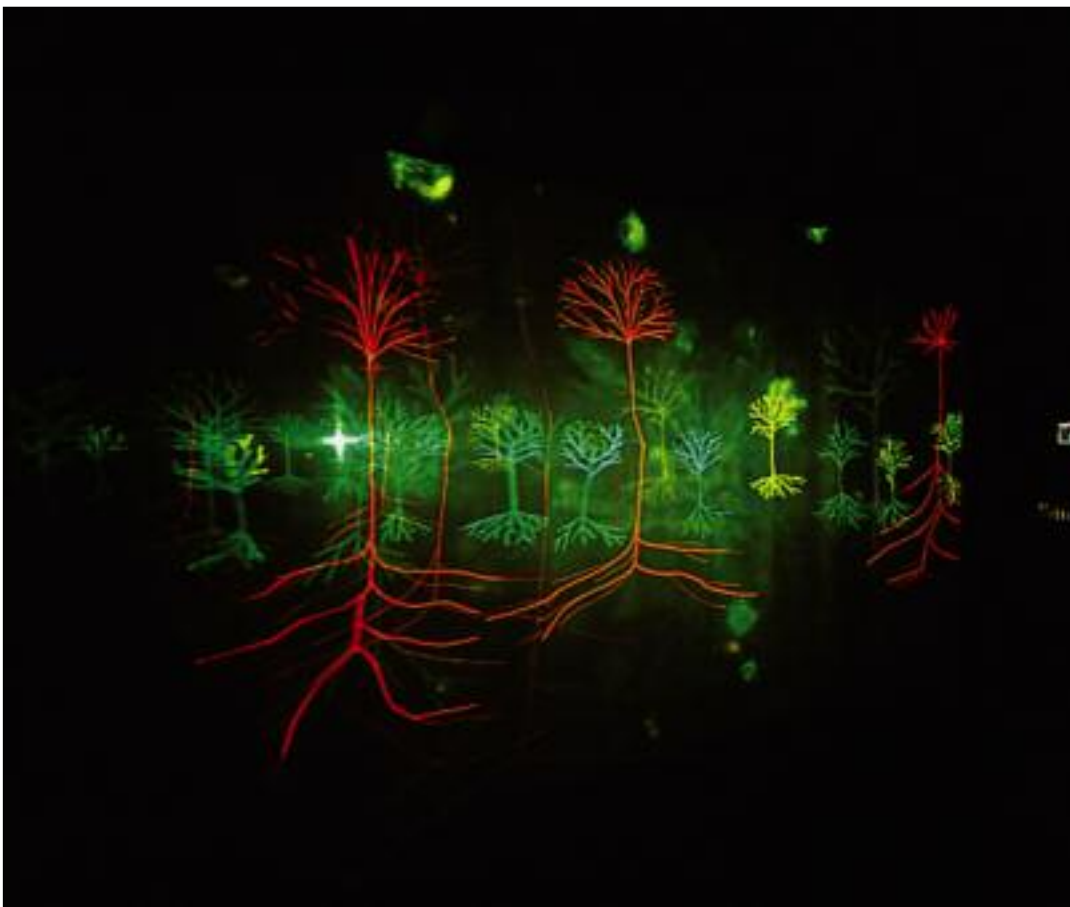
LEFT A still from Andrew Carnie's multimedia installation Magic Forest , 2002, shows neurons sprouting in the brain like trees.