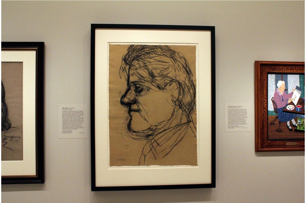
Bill Clinton, 1996 (charcoal on paper) by R.B. Kitaj, on view at the Smithsonian's National Portrait Gallery, new acquisitions corridor, July 2012.