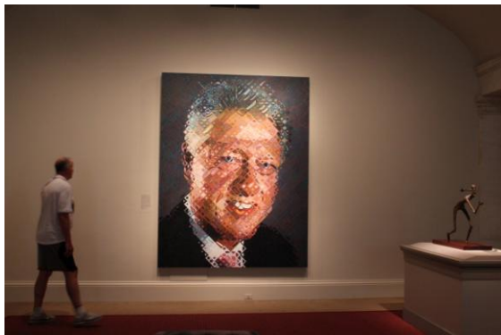
William Jefferson Clinton, 2006 (oil on canvas) by Chuck Close at the Smithsonian's National Portrait Gallery, with George H.W. Bush as a horseshoe player, 1989 (bronze) by Pat Oliphant, at right.