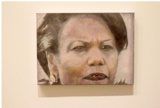
Portrait of Condoleezza Rice: "The Secretary of State," 2005 (oil on canvas) by Lucy Tuymans on view at MoMA, July 2012.