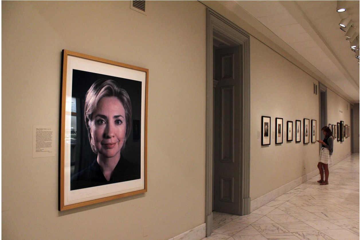
Hillary Rodham Clinton, 2000 (digital print) by Chuck Close, on view at the Smithsonian's National Portrait Gallery, new acquisitions corridor, July 2012.