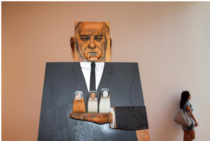
Detail of "LBJ" by Marisol Escobar at MoMA.