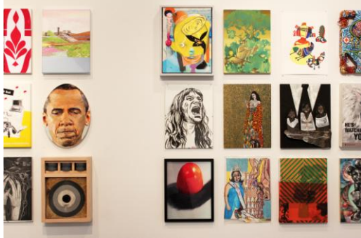
Installation view at Nancy Margolis Gallery shows portraits of President Obama at left and an image of First Lady Michelle Obama with daughters, middle row at right.