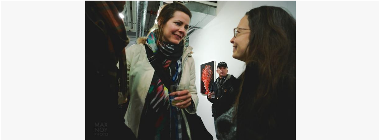
Art night is great to catch up with people