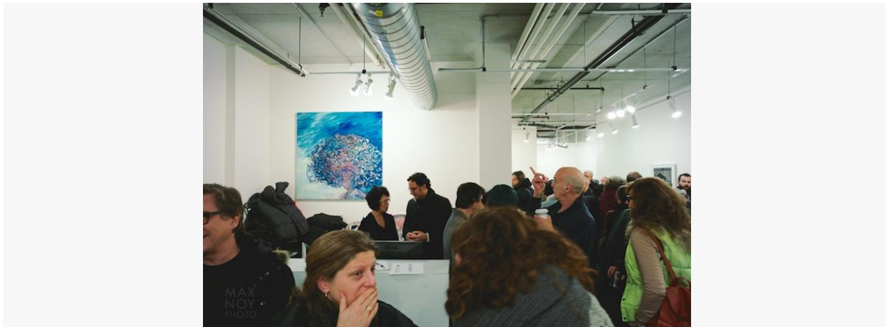
The packed house at Lesley Heller Workspace