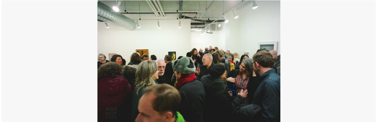
And the messy winter cold could not keep the art lovers away