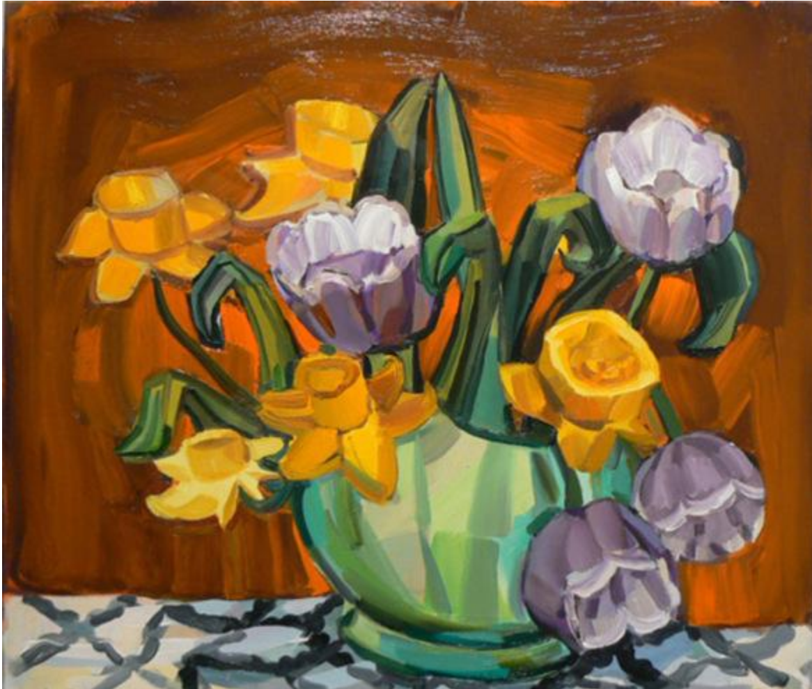
Judith Linhares, April, 2010, oil on linen, 22×26", courtesy Edward Thorp Gallery

Linhares, three flower paintings bring solidity and bounce to the moment in the floral life just as they begin to wilt. In a way they share the quality of imminent collapse of Ahyens' drawings. Rather than a mood of doom though there is a sense of the moment of beauty seized and fully engaged; particularity in Linhares' vigorous and sensuous paint handling.