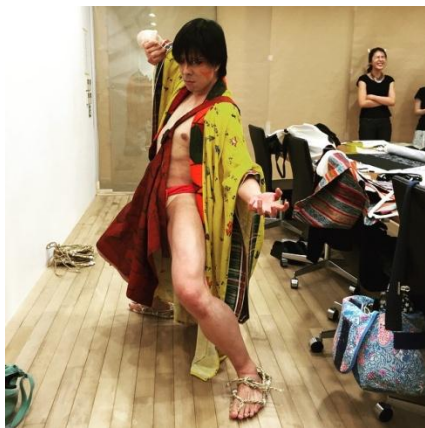
We're not sure exactly what Takashi Murakami ( takashipom ) was up to here, but we're already jealous.